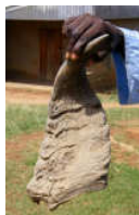
ndoŋ; ndo nε'